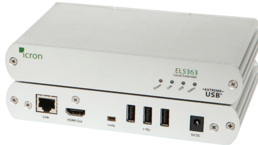
LEX (Local Extender) front view

The EL5363 KVM Extender System features the latest and most robust HD video and USB extension technology from Icron Technologies. The EL5363 extends both HDMI and USB 2.0 up to 100m using a single Cat 5e/6/7 cable.