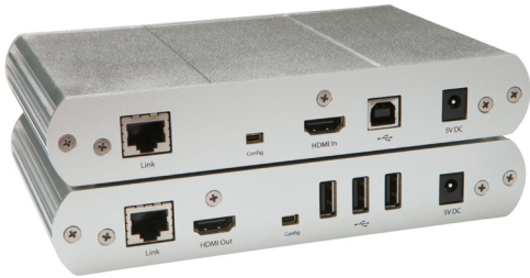
Rear view of LEX (top) and REX (bottom)