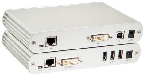
Rear views of LEX (top) and REX (bottom)