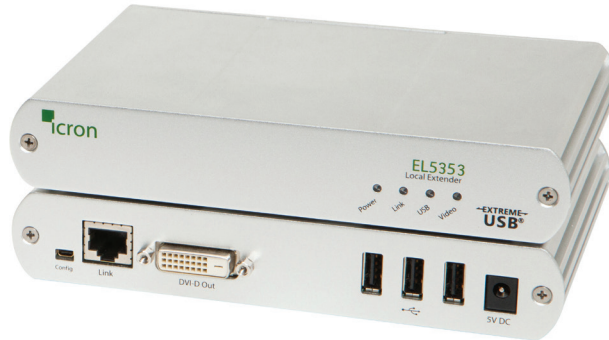
LEX (Local Extender) front view

The EL5353 KVM Extender System features the latest and most robust HD video and USB extension technology from Icron Technologies. The EL5353 extends both DVI and USB 2.0 applications up to 100m over a single CAT 5e/6/7 cable.